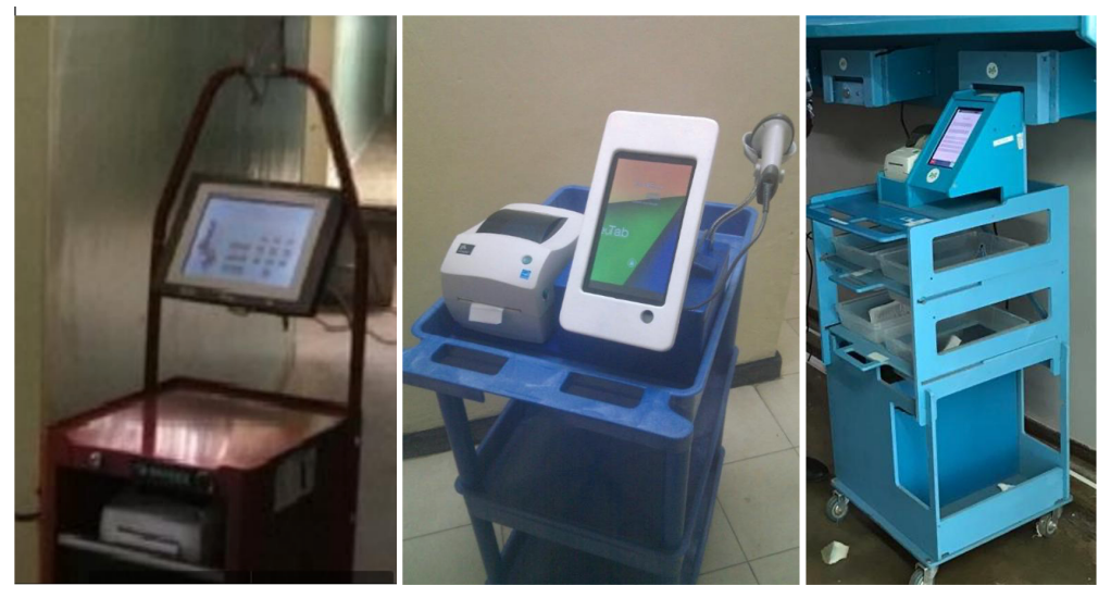
Figure 1 - The Evolution of our Computer on Wheels 2003, 2016 and 2023 respectively

18 Sinjani et al. / Re-visiting Design and Development of a Low-Cost Computer on Wheels to support healthcare delivery for Low-Resource Settings