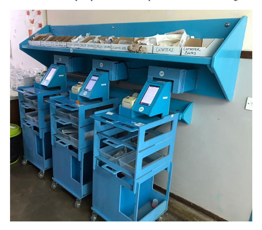
Figure 4 - The SuperDock CoW Charging Station with three CoWs Docked

We wanted a solution that was easy to connect to, could be done by the users of the cart and did not depend on a third-party to connect them for charging. Rather than having a cable connected to the cart for charging, we chose to build wall mounted "docking stations". We utilised the magnetic charger concept used on certain models of Apple laptops. Using strong magnets, we were able both hold the cart in place as well as provide the electrical connection for charging. The use of magnetically controlled switches (Reed switches) allowed us to only provide power on the charging terminals when the cart is actually docked. Rather than building separate docking stations for each cart we decided to build a station that could accommodate three carts concurrently. A picture of this "SuperDock" can be seen in Figure 4.